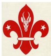
Prior to 1966 >

1966 During 1966 a new South African Scout Logo was introduced