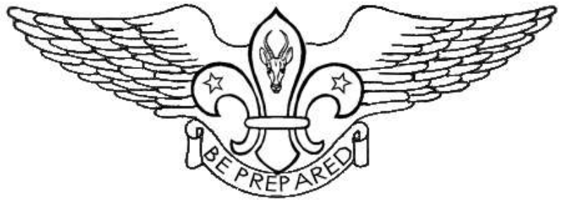
Figure 2: Example of the Air Scout logo

We have decided to extend the challenge to all members of the movement to come up with a new design for Air Scouts and a new design for Sea Scouts. This needs to be kept in line with our branding which can be found on our website.